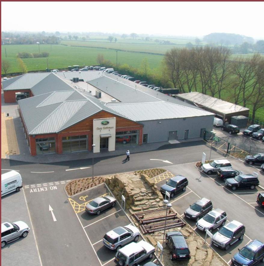
Trapezoidal Secret-Fix (SF) Insulated Roof Panel KS1000 DR/DRC